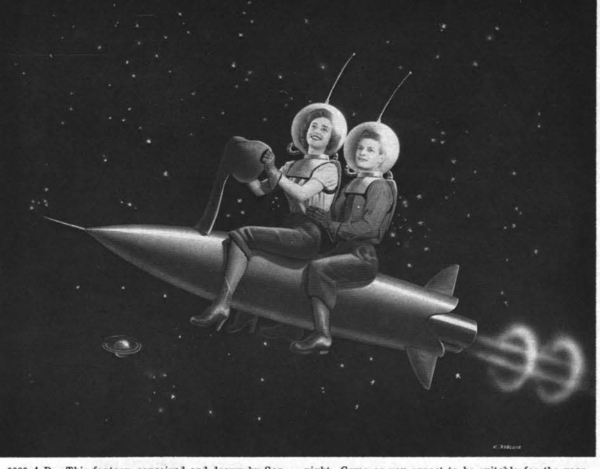
"party of the future" at the Coronado Club tomorrow